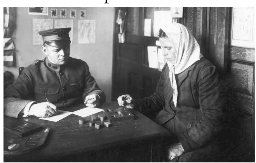
Psychological testing at Ellis Island