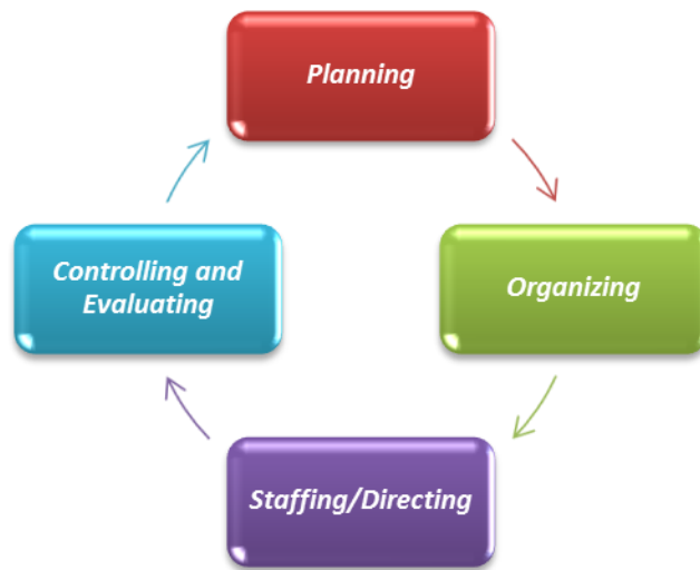
Figure 3.2 presents the relationship between these functional areas.