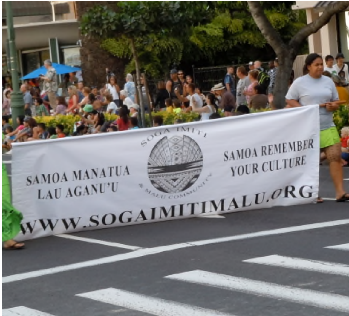
Figure 2.1 Remember "YOUR" Culture – Parade banner.