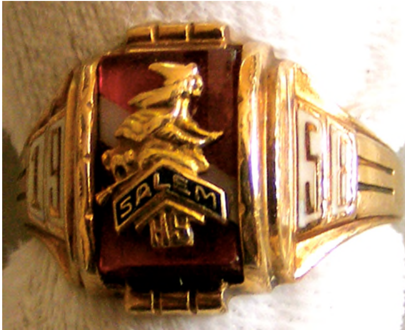
Figure 2.3 Class Ring – Meaningful icon.